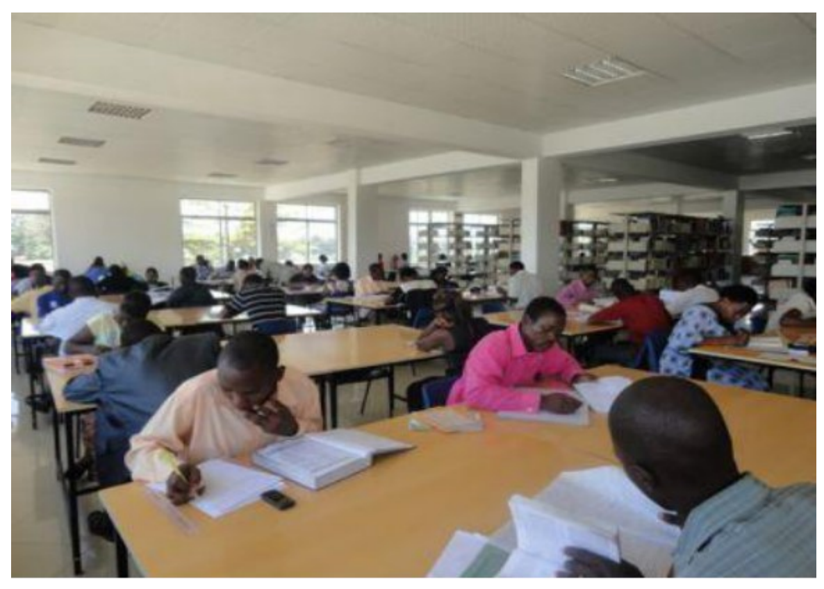
5.1 Orientation Students diligently studying in a pleasant atmosphere This is held in the